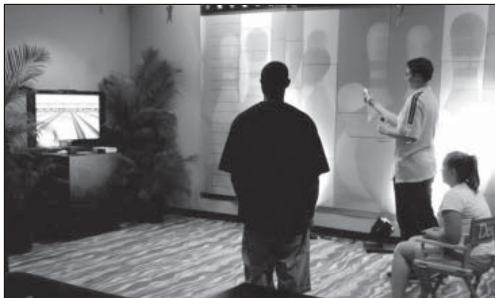
Teen Masters competitors passed time off the lanes playing Wii Video Bowling in the Dexter Den

For more info and brochures, call High Roller at 1-800-257-6179, email us at info@high-roller.com or visit us at www.militarybowlingchampionships.com .